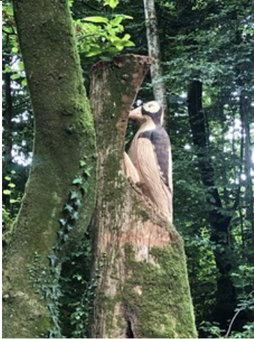
Sophie spotted a woodpecker on holiday!