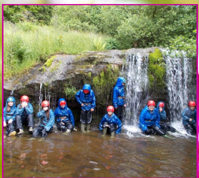
A little farewell to our gorgeous Year 6 children.

Well, here we are: The Final Staverton Bell of the year! As I think back over 2024-24, I can think of many challenges, but also many achievements. It's so easy to forget all the amazing things that have happened over the course of the year. Here's a little highlight reel for you: