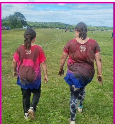
See some of our children's incredible achievements.