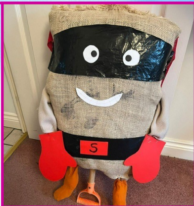
Have a look at some of our great scarecrows.